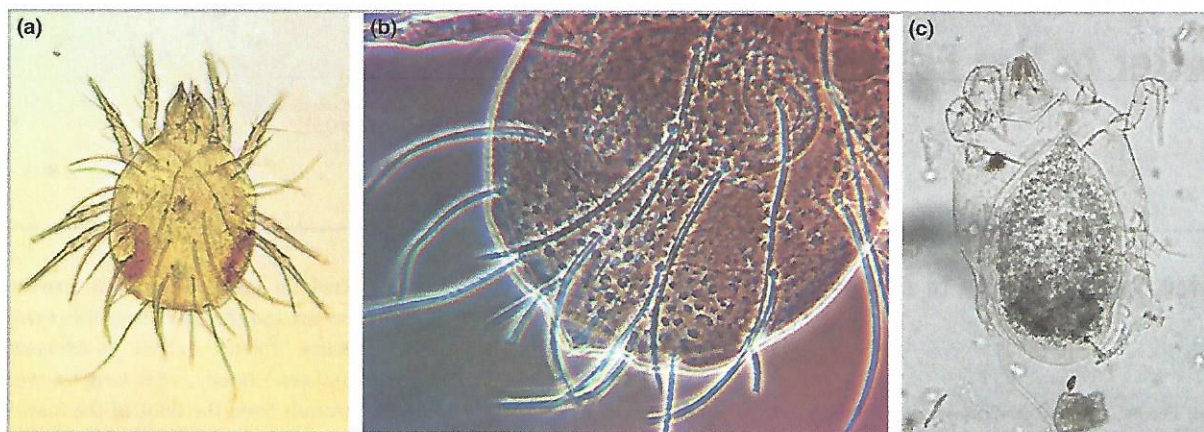
Fig 2. Aeroglyphus robustus . (a) Adult male (original magnification \times 100 ), (b) opisthosoma with typical tubercles and multibranching bristles (contrast phase, original magnification \times 400 ) and (c) hypopial deutonymphs with hypopus (original magnification \times 100 ).

fumigated with cyphenothrin. Immediately the patients' skin lesions improved, but after 2 weeks similar new skin lesions in the farmer and his wife appeared again. Probably, hypopial deutonymphs restored the mite population, resulting in a new infestation. A second fumigation with cyphenothrin resolved the domestic infestation, as shown by the resolution of skin lesions and by the negativity of a further E.D.P.A. study.